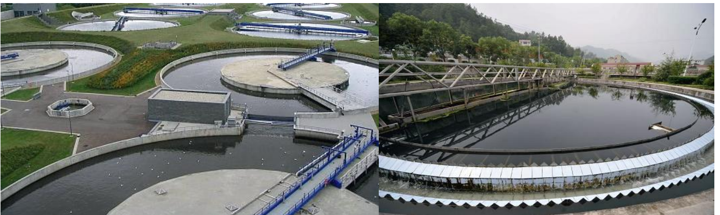
Sewage Treatment Plant