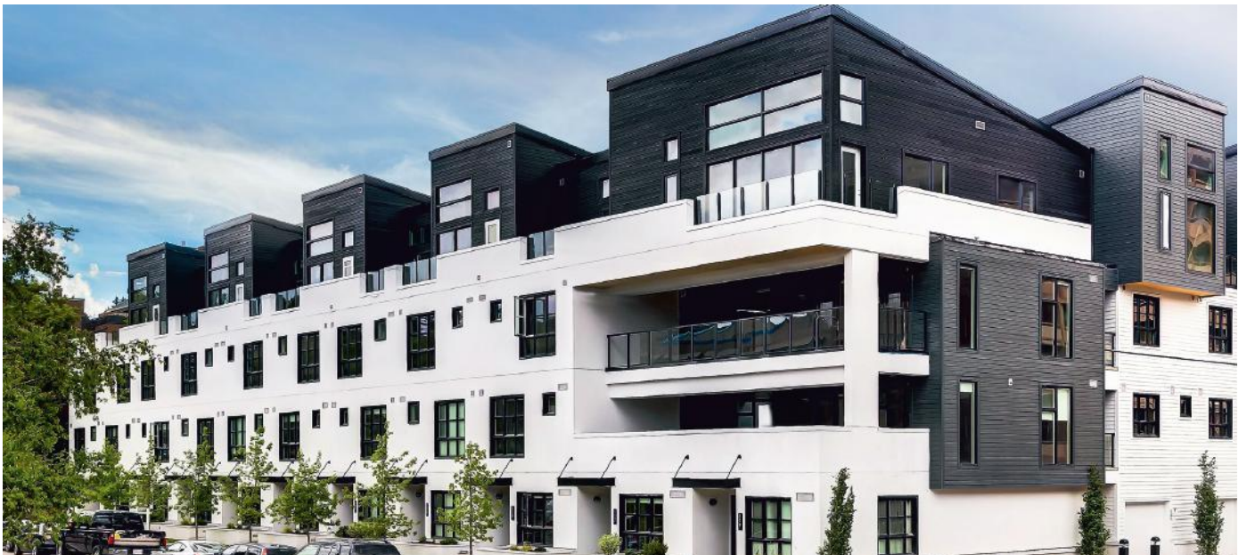
Multi - Residential Apartments And Condominiums.