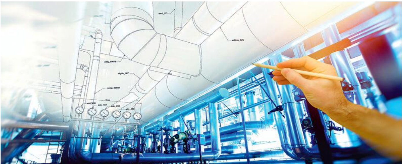
MEP WORKS (Mechanical Electrical & Plumbing)