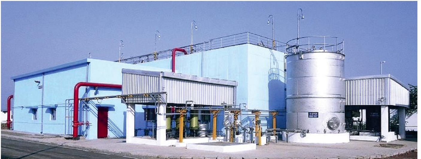
Industrial Segment Consisting Of Manufacturing Units & Other Industrial Plants