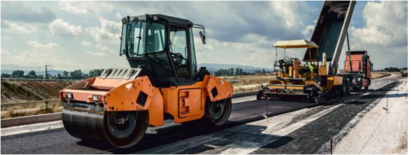
Highway Work (PUP, VUP, & BOX CULVERT)